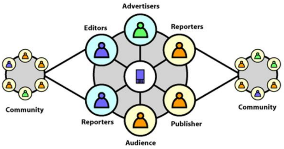
Figure 1: Participatory journalism (Bowman and Willis, 2003).

journalistic workflow dictating the decisions of a staff'. As a substitute there are various concurrent conversations on social networks, as depicted in figure 1.